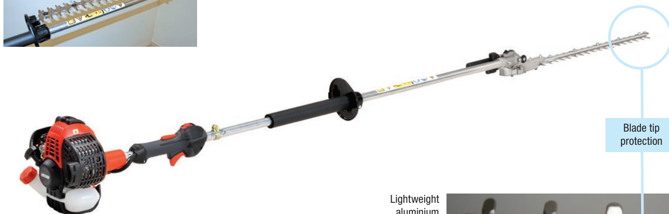
Blade tip protection