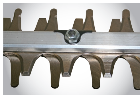
Integrated blunt – blunts are part of the blade

The HCA-265ES-LW has a 25.4cc engine and Easy Start for fast, almost effortless starting. Its double-edged blades are nickel-plated so stay sharper for longer.