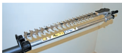
180° rotation into storage position