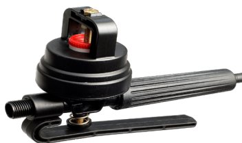
Dosimeter Valve without Applicator Pipe U8096.00

The Dosimeter Valve allows for highly accurate and consistent volumes of fluid to be delivered with each squeeze of the trigger. This unique accessory can be used with any of our backpack and compression sprayers and with other brands of sprayers. The amount of fluid delivered can be adjusted from 2ml – 25ml per stroke.