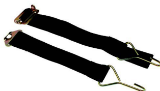
Waist Belt for 20L Backpack Sprayer K9774.00.00