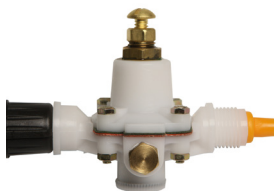
Flow Rate Regulator Standard without Pressure Gauge U9639.00