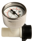
Pressure Gauge with Connector U9650.00