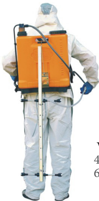
Vertical Rear Boom 4 nozzles - U9898.00 6 nozzles - U4288.00