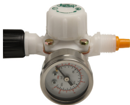
Flow Rate Regulator with Pressure Gauge U9634.00