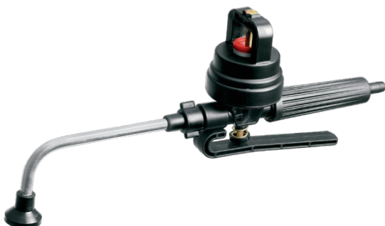
Dosimeter Valve with Applicator Pipe U8018.00