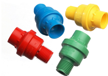
Regulating Valve Pressure and Flow Yellow (1BAR) - U7464.00 Red (1.5 BAR) - U7465.00 Blue (2 BAR) - U7466.00 Green (3 BAR) - U7467.00