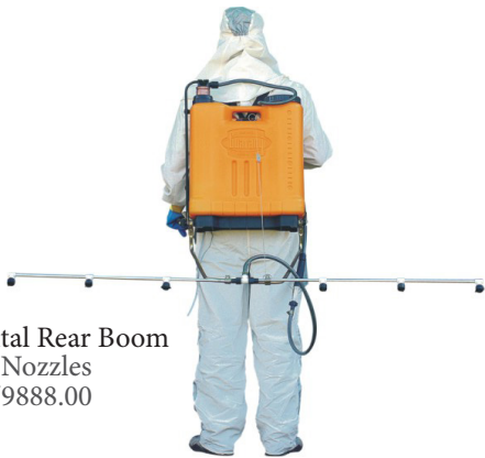
Horizontal Rear Boom 6 Nozzles U9888.00