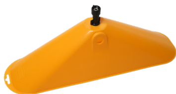
Weed Control Shield U7860.00