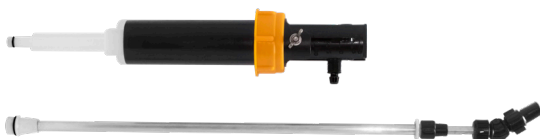
100ml Dosing Kit U8146.00

A dosing kit and lance to be fitted to our 20 litre and 12 litre backpack sprayers. This allows for precision dosing of between 10 and 100ml of liquid fertiliser, herbicide or pesticide, preventing wastage or overspraying.