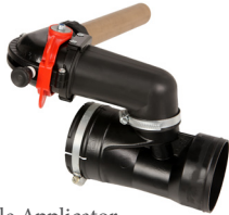
Granule Applicator (available separately) Product ID: U8076.00