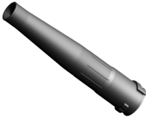
Blower nozzle (included) Product ID: U7582.00

Suitable for use indoors and outdoors for spraying crops and plants and for disinfectant fogging. Can be used in the disinfection of stables, barns, hen houses, warehouses etc. Separate granule applicator enables the product to spray powders. 4.6 HP. Vertical/horizontal reach 12/18m. 13.05 kg. Product ID: 0401.50.